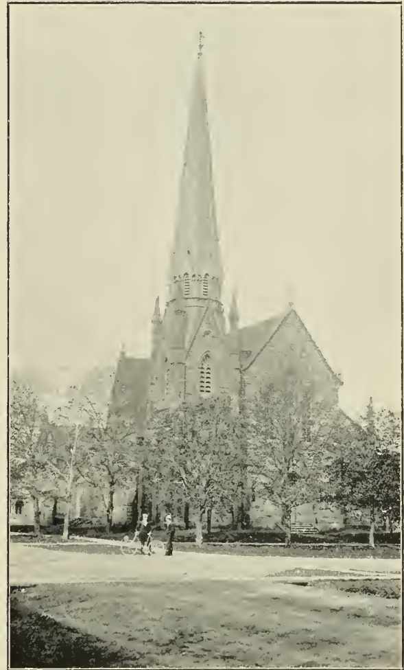
ST. JAMES PRESBYTERIAN CHURCH. CHARLOTTETOWN, P.E.I.

Brackley Beach is reached by a carriage drive of fifteen miles from Charlottetown, and the surf bathing and fishing are excellent. Other pleasant resorts within a few miles are Rustico Beach, Tracadie Beach, Stanhope and Hampton. Malpeque, Alberton, Tignish and Souris are famed for their plover and sea-fowl shooting. Georgetown is another tourist centre, and is a beautifully laid out town. Altogether, Prince Edward Island can accommodate many thousands of tourists during the summer months, and has enough delicious pure air to supply millions with new life and vigor.